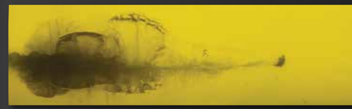
Gelatin shot with 165-grain 30-06 Spring, Fusion (F3006FS2) at 100 yards.

*Three-shot averages fired into bare 10 percent ballistic gelatin at 100 yards through a 22-inch barrel.